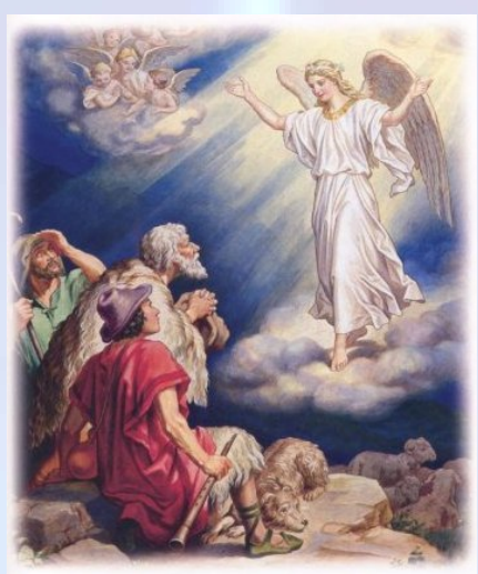
The Announcement of Christ's Birth to the Shepherds

Now there were shepherds in that region living in the fields and keeping the night watch over their flock.