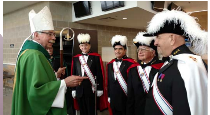
Honor guard at the Catholic Men's Conference with Bishop Campbell